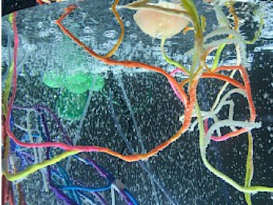
Pinar Yoldas, Ecosystem of Excess (Detail) , 2017, Variable Dimensions, Photo: Pinar Yoldas